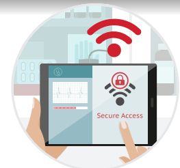
Securely control medicines with two-factor authentication