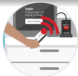
Enable access using either a badge or a smartphone