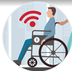
Track medical equipment using BLE beacons